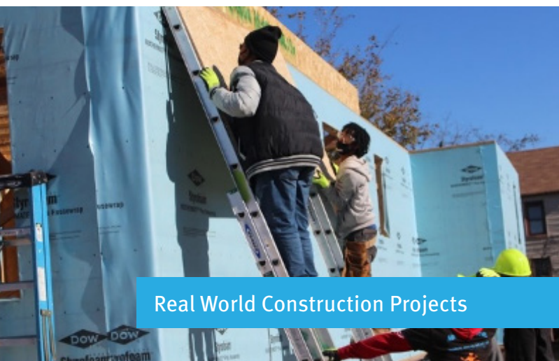
Real World Construction Projects